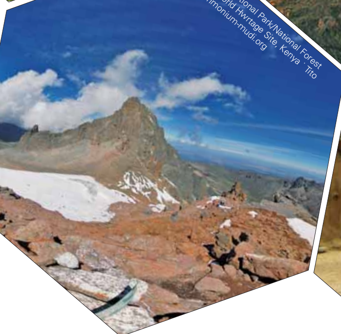
Mount Kenya National Park/National Forest UNESCO World Hyrthage Site, Kenya