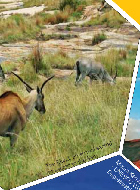
The Eland, an animal sacred to sacred to the San