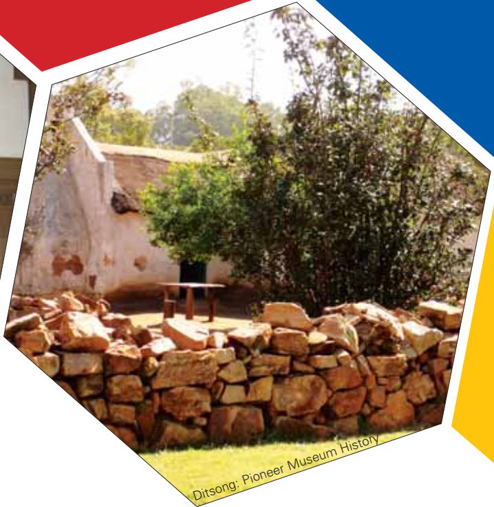
Ditsong: Pioneer Museum History