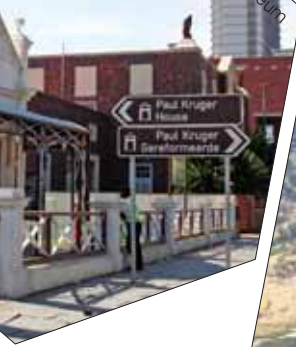
Ditsong: Kruger Museum