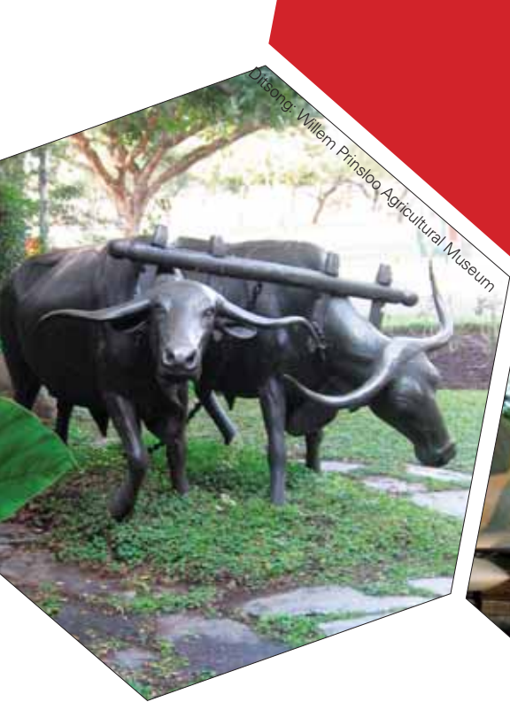
Ditsong: Willem Prinsloo Agricultural Museum