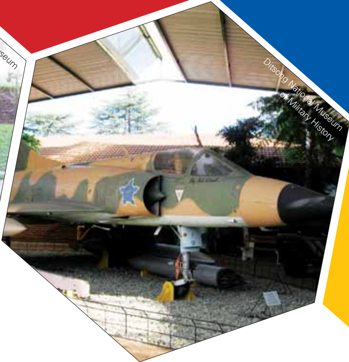
Ditsong National Museum of Military History

Visitors can play a game of croquet or walk through the garden. Refreshments can be enjoyed under shady trees in the teagarden. The restaurant also offers a Victorian picnic in the garden or dinner in the kitchen.