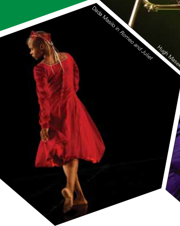
Dada Masilo in Romeo and Juliet