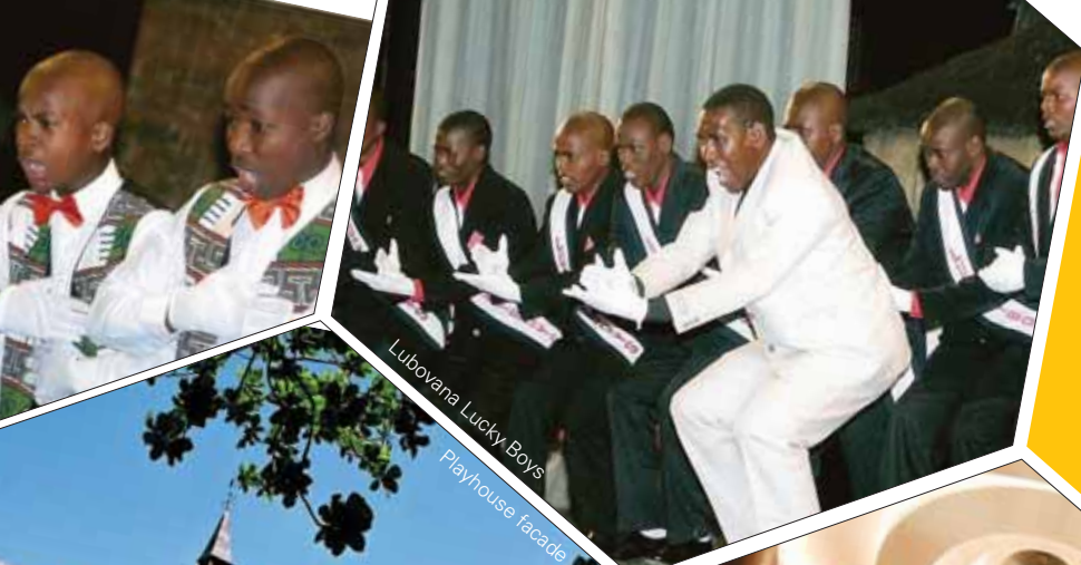
Lubovana Lucky Boys Playhouse facade