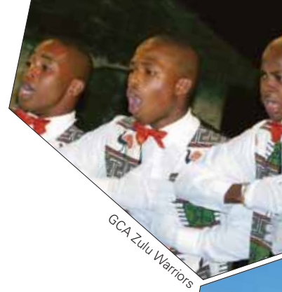
GCA Zulu Warriors

The annual touring production staged by Northwood High from Johannesburg is the 1970 Biblical musical Godspell by Stephen Schwartz and John-Michael Tebelak.