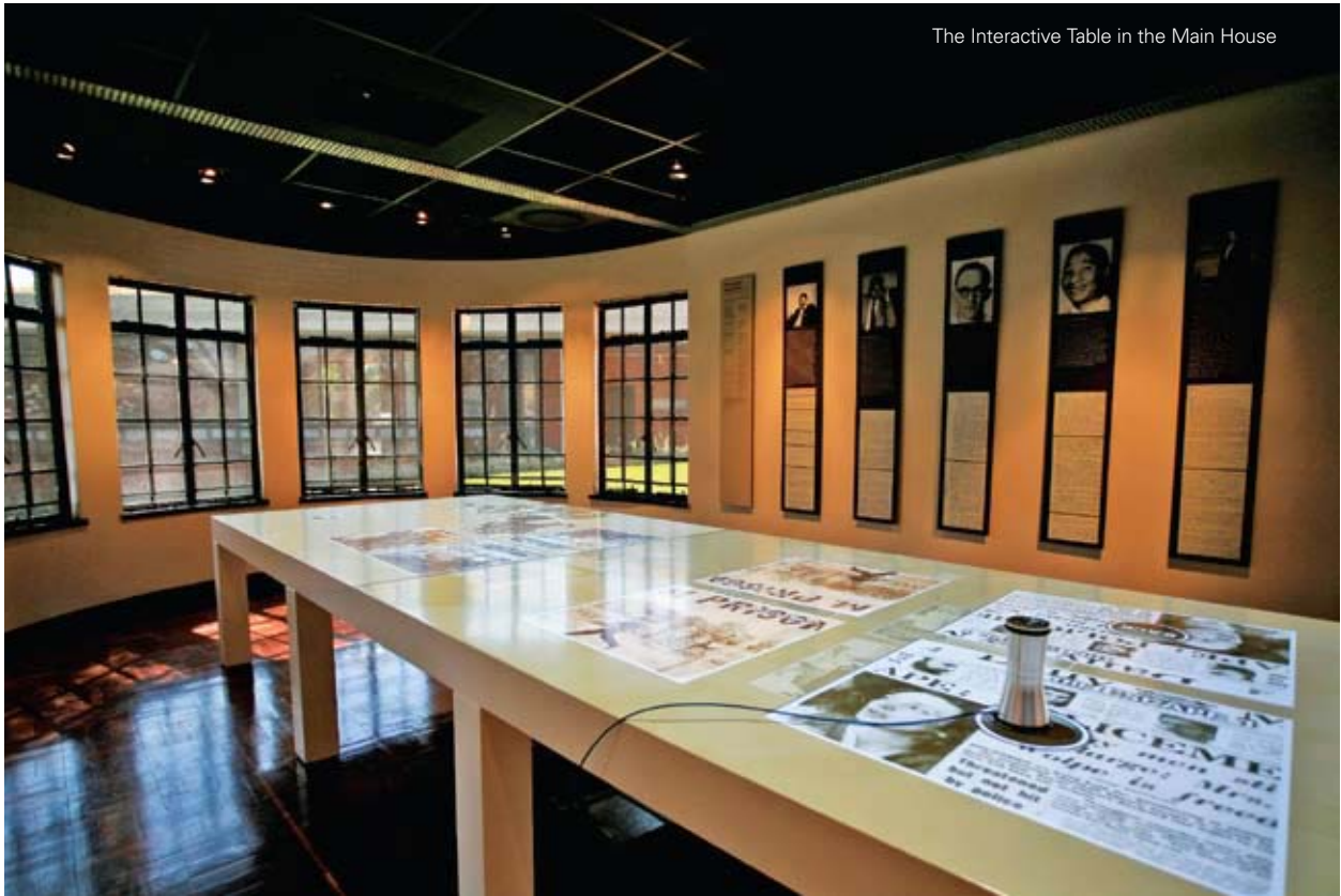
The Interactive Table in the Main House