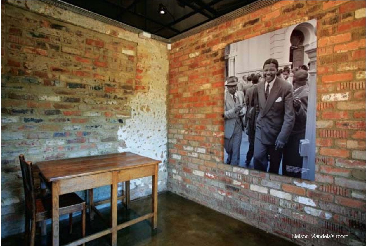
Nelson Mandela's room