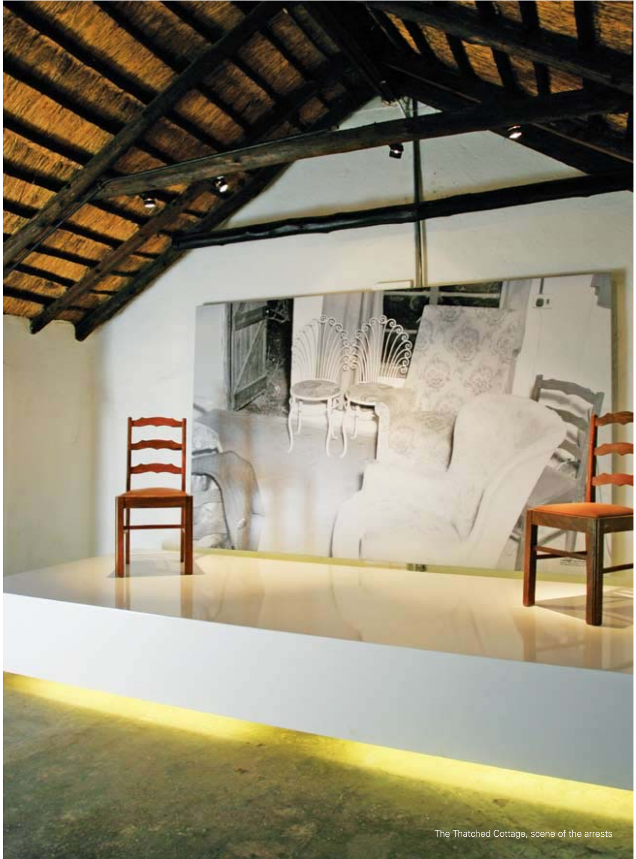
The Thatched Cottage, scene of the arrests