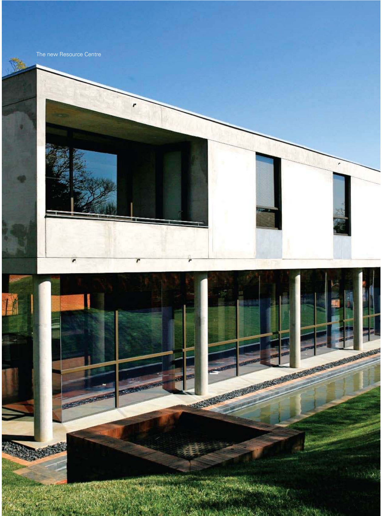
The new Resource Centre